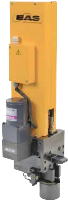
ETDCE with MHC hollow ram cylinder

Available with ECA or MCH hollow ram pull cylinders Clamping capacity range 40, 60 or 100 kN Travel distance: 400 towards 1200 mm Travel speed: 100-150 mm/sec Temperature range: 5°C till 60°C